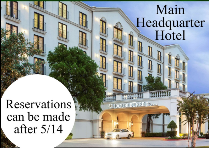
Main Headquarter Hotel